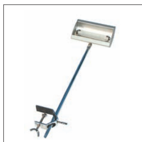
Reflector cu brat 300W EUR 50.00 Cod 019.010.200.010