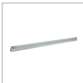
Lampa fluorescenta FIA EUR 24.00 cu instalatie electrica completa 1x40W Cod 019.010.110.000