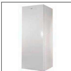
Frigider ARCTIC 255 I EUR 80.00 Cod 025 010 020 199