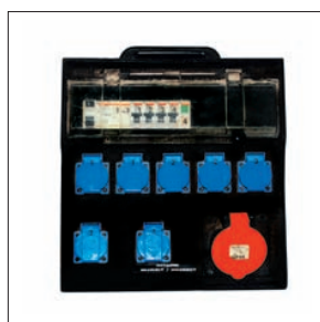
Panou Electric 380V/220V EUR 210.00 Cod 019.010.265.000