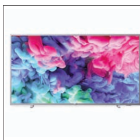
TV LED SMART 4K, EUR 55.00/zi UHD ultrasubtire (diagonala ecran: 126 cm) Cod 025 010 130 045