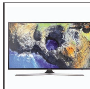
TV SAMSUNG UHD EUR 85.00/zi (diagonal screen: 163 cm) Code 025 010 130 047