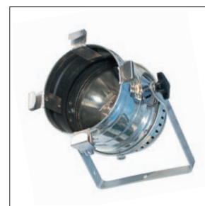
Reflector PAR64 500-1000W EUR 55.00 Cod 019.010.200.020