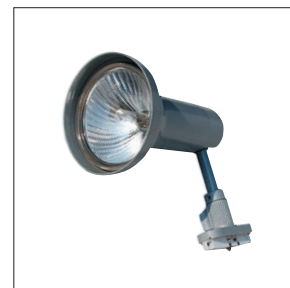
Spot halogen 100W EUR 24.00 SY STAR Cod 019.010.185.000