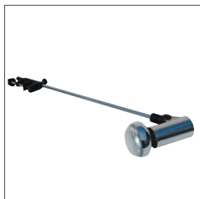
Lampa spot cu brat EUR 21.00 Cod 019.010.180.000