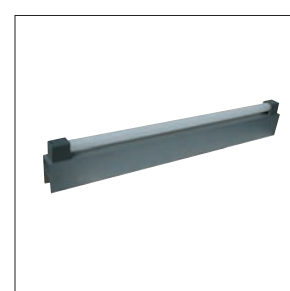
Corp fluorescent tip SS30 EUR 24.00 cu un tub D-170 Cod 019.010.190.000