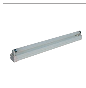
Corp fluorescent tip SS30 EUR 27.00 cu un tub D-170 -A Cod 019.010.190.001