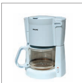
Filtru de cafea EUR 10.00 Cod 025.010.120.010