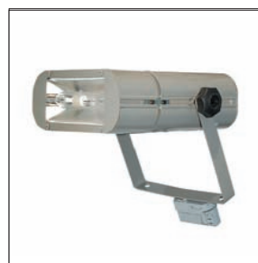
Reflector IVEN HQI 150W EUR 50.00 Cod 019.010.200.005