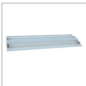
Corp fluorescent tip OCTANORM EUR 29.00 cu doua tuburi D-171 Cod 019.010.200.000