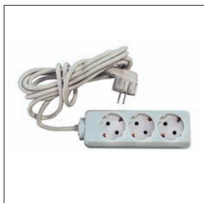
Prelungitor 230V, 10A, 3m EUR 18.00 Cod 019.010.277.000