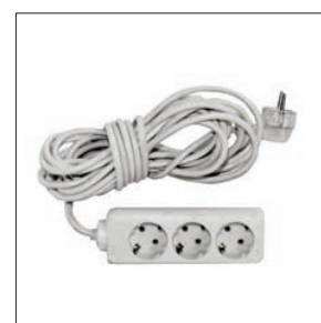
Prelungitor 230V, 10A, 5m EUR 18.00 Cod 019.010.279.000