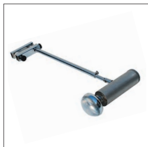
Lampa spot cu brat 100W EUR 21.00 Cod 019.010.181.000