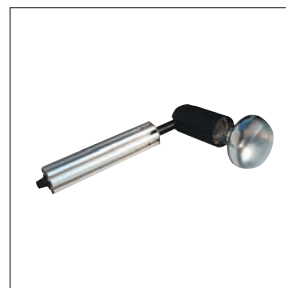
Lampa spot stut OCTANORM EUR 21.00 Cod 019.010.187.000