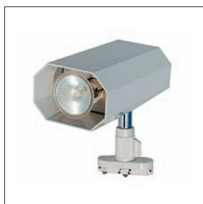
Spot halogen SY STAR 50W(A) EUR 24.00 Cod 019.010.186.000