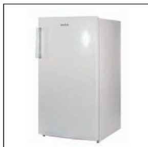
Frigider ARCTIC FB 155 EUR 36.00 Cod 025 010 020 198