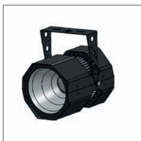
Reflector LED VIRGO 40W 4350 LM 4100 K EUR 55.00 Cod 019.010.200.045